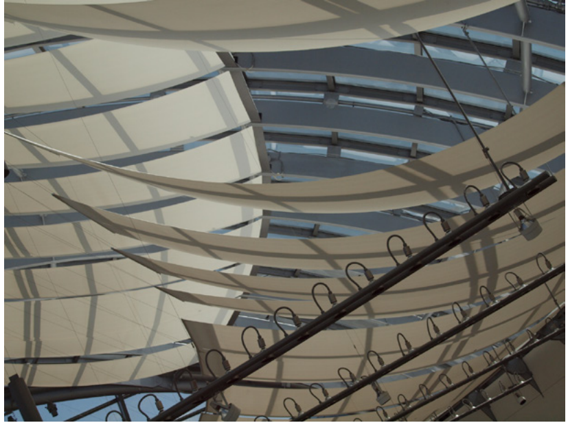
Unfurled #2 Peabody Essex Museum Series 19.5 x 25.5 (framed 25.5x31.5)

"Museum Pieces" is an ongoing project of photo shoots of museum buildings. This project presents the buildings of selected art museums as art objects themselves. Works in this project include images from The Boston Institute of Contemporary Art (ICA), the Peabody Essex Museum (PEM), National Gallery of Art, Hirshorn Museum, National Portrait Gallery, Smithsonian Air and Space Museum, Smithsonian Natural History Museum and the National Portrait Gallery. Sessions for shooting other buildings such as the Yale Art Gallery are currently being arranged.