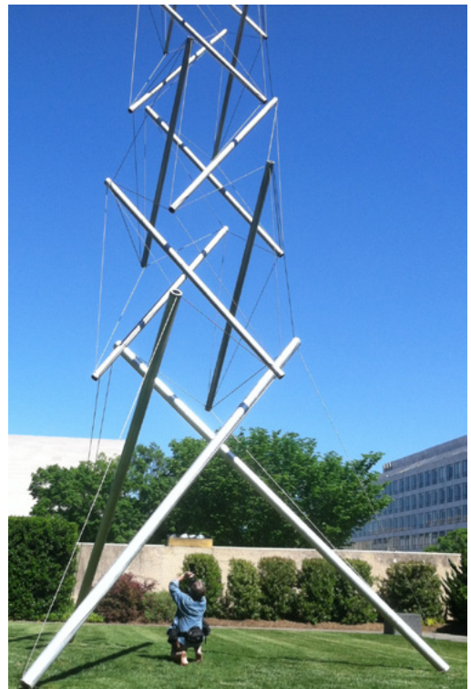
Shooting Snelson's Needle Tower

This project is an offshoot of the "Museum Pieces" project. Sometimes when I'm shooting a museum for the ongoing "Museum Pieces" series I see a piece in their collection that inspires me to show it in another light or from another perspective. I have this odd ability to rotate and manipulate objects in my head and see what they would look like from a perspective other than the one they are presented in. "Pieces Parts" is a series of those images showing my perspective on those art works. The art work is generally abstracted and repurposed and is most often unrecognizable, even to those familiar with the subject art (such as "The Stars Above" shown here, which is my image of Snelson's "Needle Tower" which you can see me shooting below).