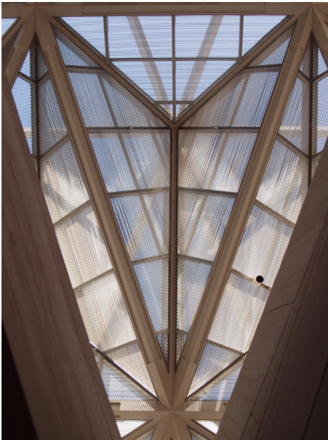
Good Point #1 National Gallery of Art Series 19.5 x 25.5 (mounted on mdf)

"Museum Pieces" was previewed in the "Wall" series at Travessia Winery in New Bedford in June and July of 2013 and had its first full scale showing at the Alexey von Schlippe Gallery, University of Connecticut at Avery Point in June and July 2014. It is available for showing now. It currently consists of over 30 framed or finished mounted pieces and continues to grow.