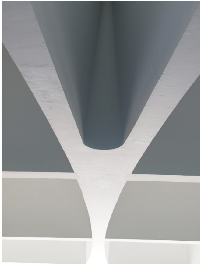
A Supporting Point Hirshorn Museum Series 19.5 x 25.5 (mounted on mdf)

My photos generally concentrate on the interplay of angles and shapes and light. I compose with a point of view that is intended to confound the viewers' normal perspective and view of the world. I enjoy playing with the viewers' perceptual tendencies in ways that make them engage with the image as they try to force it into a more usual perceptual framework. I do this in various ways from using radical perspectives, tight and unusual composition, subtle lines that skew the perspective in a way the mind tends to reject and readjust, placing the focus in unexpected places or the simple inclusion of odd detail. I often create